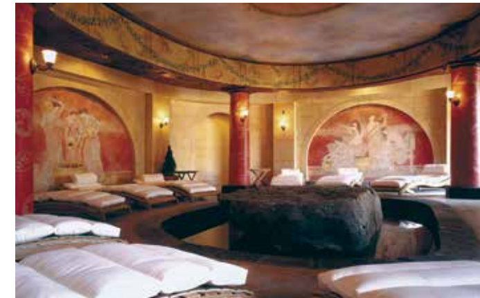
Left: Hector Falls. Above: The relaxation room at Mirbeau Inn & Spa.

home, I visited nearby Anyela's Vineyards. It was a perfect, cloudless day, and as I sipped a glass of chardonnay and gazed at the rhythmic rows of vines and calm blue waters of the lake beyond, I made sure to take a moment to savor all of the wonderful things I experienced during my all-to-brief foray into the fabulous Finger Lakes. ■